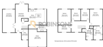
Plan produced by Woodside Photography Floorplan for illustration purposes only and all measurements are approximate